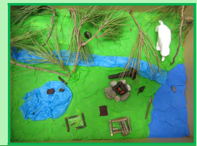
The Island from Touching Spirit Bear by SG

Clay Animation / Video Class 7/8<sup>th</sup>: In the final phase of production – post-production, students are adding voice-over narratives, music, and editing their many photos of their clay animated fables.