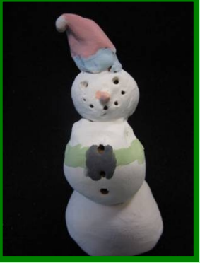
Snowman by EB